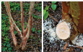
Maintain an attractive framework

Prune suckers and any additional trunks as close to the